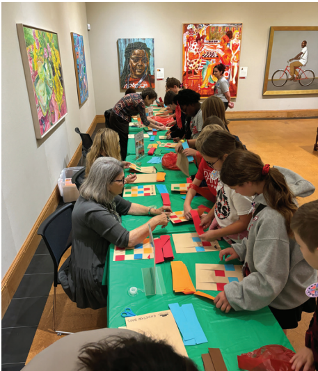
Weaving activity during Choctaw Days