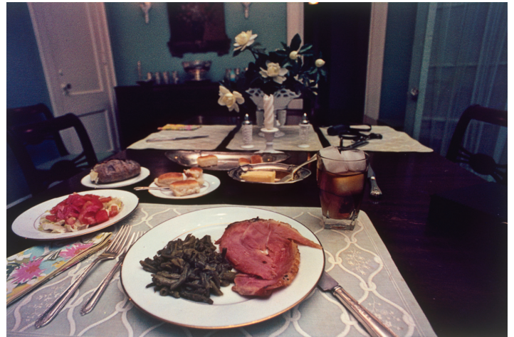
William Eggleston (American, born 1939) Sumner, Mississippi 1972 Dye transfer print. Printed 1986 © 2026 William Eggleston

Together, these works deepen our growing photography collection and continue the momentum established by recent additions, including the six Eudora Welty photographs acquired last year.