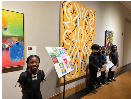
Laurel Magnet School for the Arts students at Night at the Museum in November