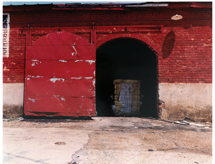
William Christenberry (American, 1936–2016) Cotton Warehouse with Cotton Bale, Selma, Alabama 1980 Dye transfer print. Printed 1982