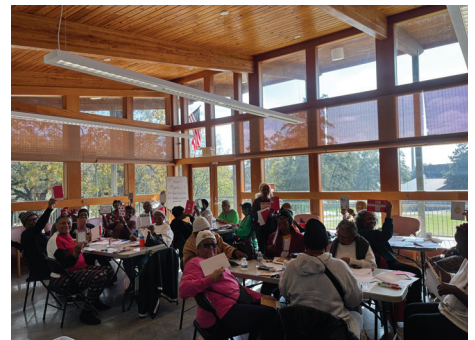
Laurel Senior Center Christmas activity

Follow LRMA on Facebook at Lauren Rogers Museum of Art and X @LaurenRogersMoA.