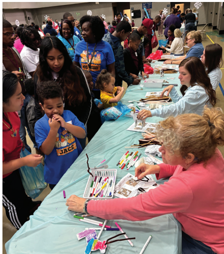
Very Special Arts Festival in November