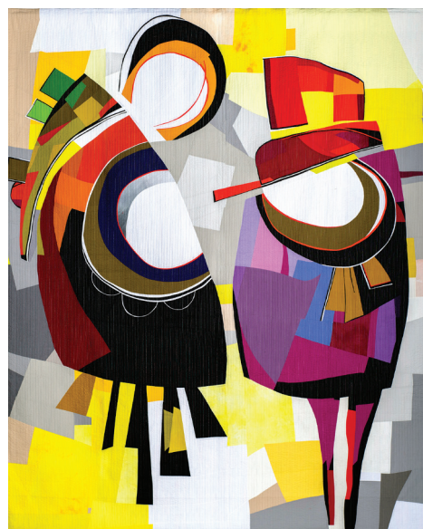
Irene Roderick (Austin, Texas), Twitter , 2022, Cotton, machine pieced, machine quilted