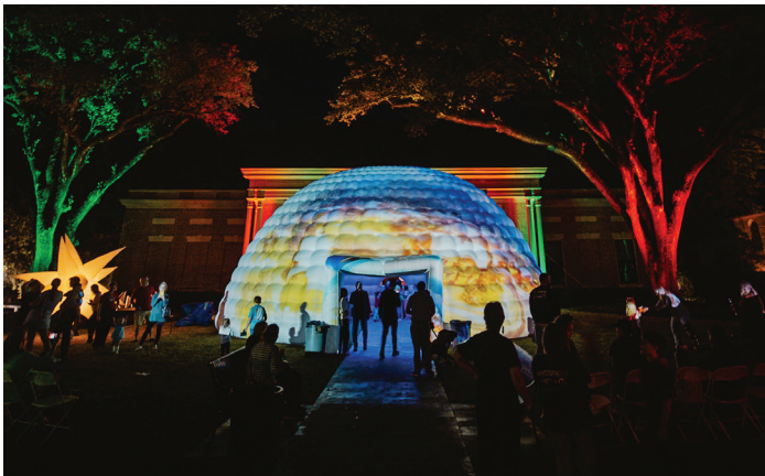
IGLOOmination in December on the museum front lawn

We also ended the year with an incredible holiday projection show— IGLOOmination! Held on our front lawn for two evenings in December, the magic of Christmas came alive for our community. Many thanks to Community Bank for their sponsorship of the event and to Colin McQuilkin Design for their amazing animations and production.