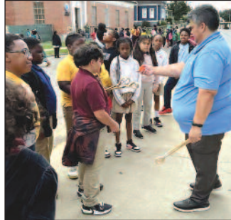
Choctaw Days in October featured stickball demonstrations.