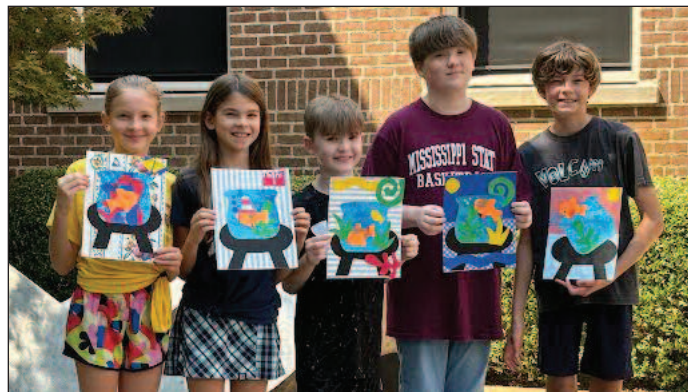
Matisse collage activity at the museum