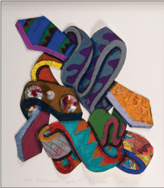
Kevin Earlee Cole, When Blessings Meet Opportunity , 2000, Mixed media, 26 x 23 1/4, Photo by Greg Staley, © Kevin Earlee Cole

FEBRUARY 4 - APRIL 20, 2025 LOWER LEVEL GALLERIES