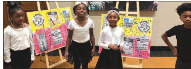
Students from the Laurel Magnet School for the Arts at Night at the Museum in November