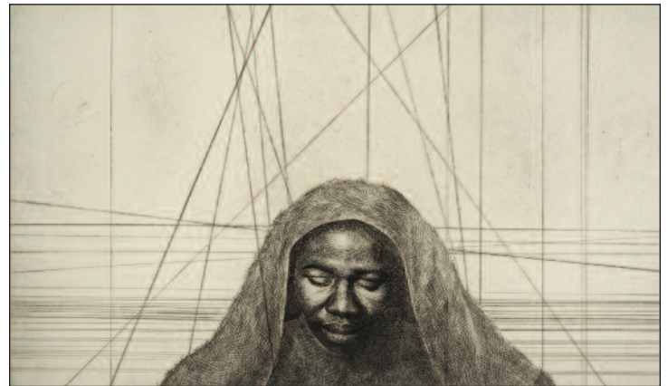
Charles White, Lily C. 1973, etching.