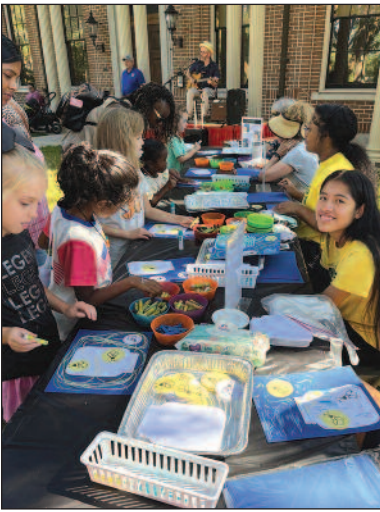
Heritage Arts Festival was a success in October.