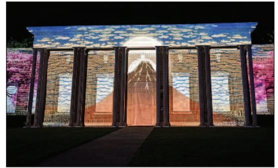
Under the Oaks: Light Up the Night was held in October.