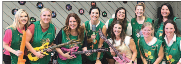
The Laurel Arts League helped with our Very Special Arts Festival in November.