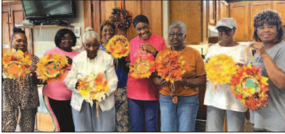
LRMA Education Outreach program at the Laurel Senior Center in the fall