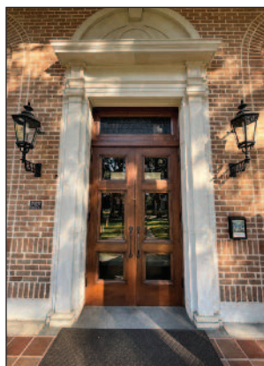
New museum front doors were installed in the fall.