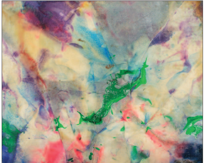
Sam Gilliam, Untitled, 1974, oil acrylic on rice paper.