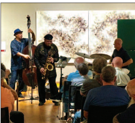
The July concert from the Museum's summer jazz series