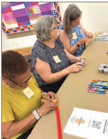
LRMA guild members participated in Scrollathon at the Museum in July.