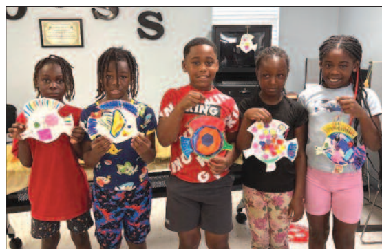
LRMA led weekly art activities at Windsor Court as part of the Laurel Housing Authority's summer feeding program.

Follow LRMA on Facebook at Lauren Rogers Museum of Art and Twitter @LaurenRogersMoA.