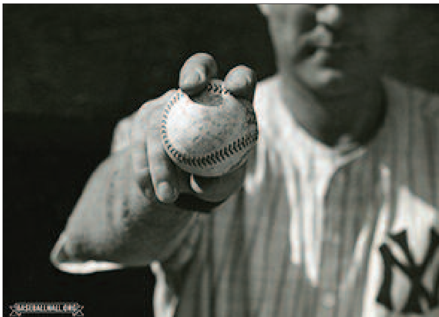
Red Ruffing's fastball grip , by William C. Greene c. 1938, courtesy of the National Baseball Hall of Fame and Museum

Preserving the historic link between baseball and photography, the National Baseball Hall of Fame and Museum’s collection of approximately 350,000 unique images is the world’s premiere repository of baseball photos, spanning well over 150 years of the sport’s history. The Picturing America’s Pastime exhibition features a variety of these timeless pictures, many by distinguished photographers and each accompanied by an enriching and historic quote. The exhibition commemorates and celebrates the inextricably entwined worlds of baseball and photography by picturing America’s pastime.