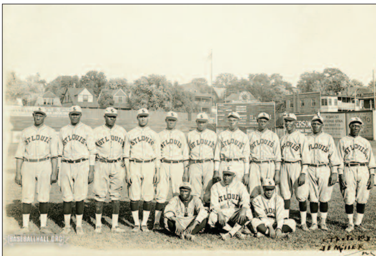
Negro National League, St. Louis Giants