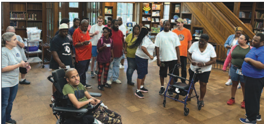
The ARC visited the Museum in July for a summer social.