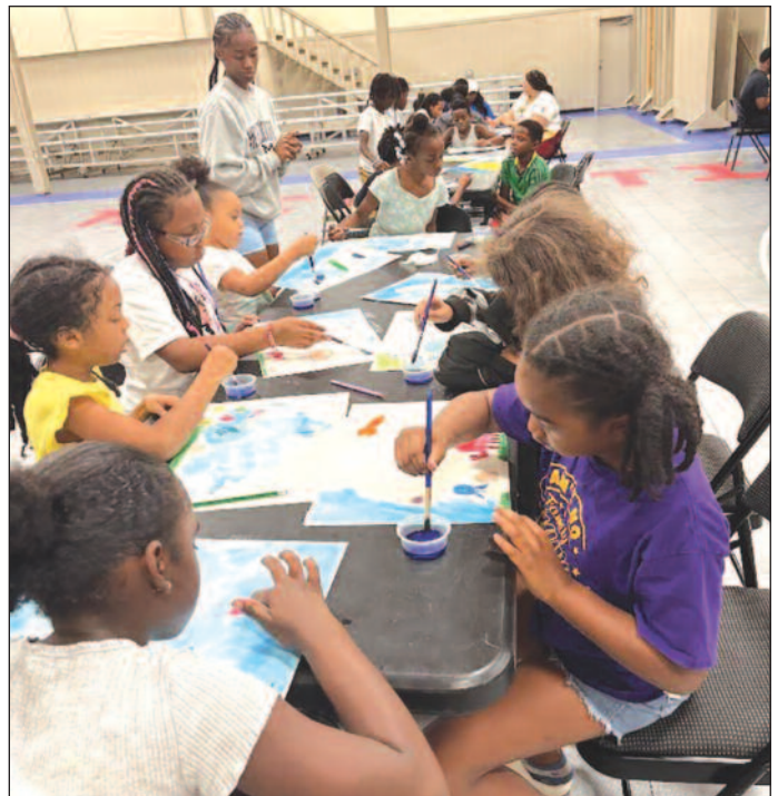
LRMA art activity at the L. T. Ellis Center summer feeding program

Our education program continues to be a strong component of our mission, and this summer was no exception. A highlight for us each summer is our partnership with the Laurel Housing Authority where we have provided art activities for their summer feeding program for more than 20 years. Other free public summer programs included Free Family Art and Drop-In Drawing, along with a variety of classes and camps. I must