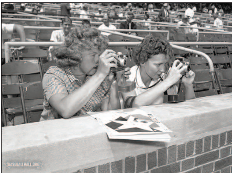
Fans at the All-Star Game, July 30, 1962