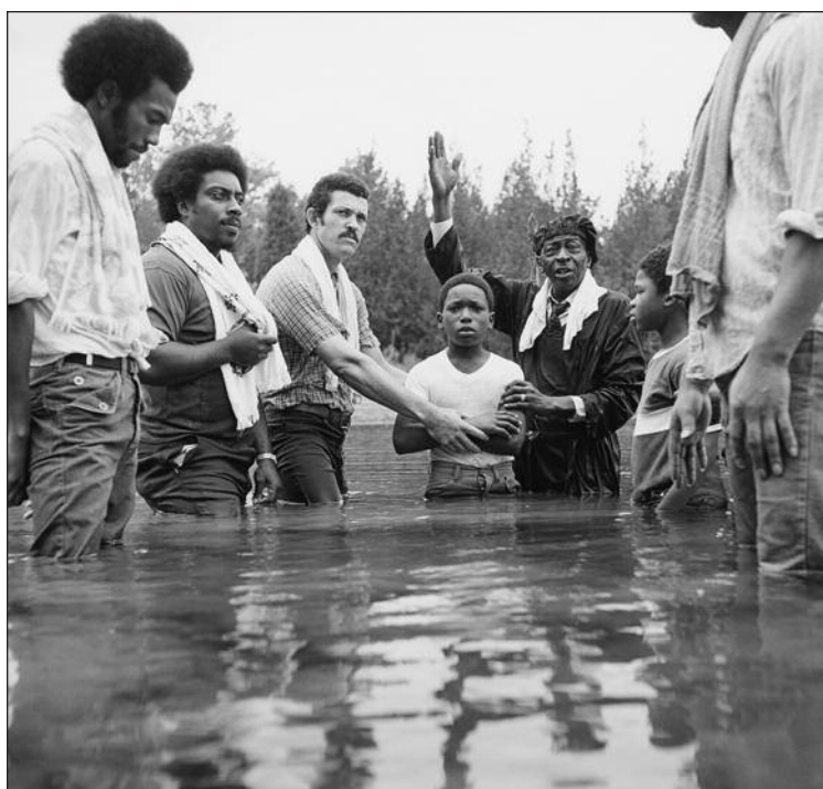
Birney Imes, III (American/MS, B. 1951), Baptism , 1983, Gelatin silver photograph, Gift of Birney Imes, III, 84.22