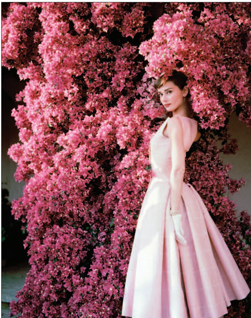
Norman Parkinson (English, 1913-1990), Audrey Hepburn with Flowers , 1955 (Printed 2017), Limited Edition Estate Print, Titled, dated and numbered in ink on verso, Archival Digital C-Print