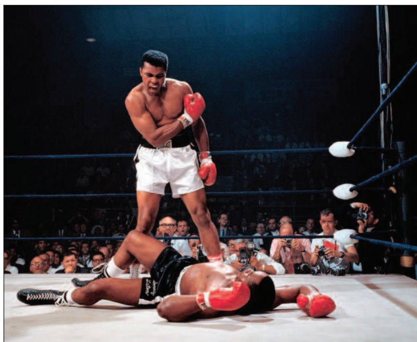
Neil Leifer (American, born 1942), Muhammad Ali vs Sonny Liston , 1965 (Printed Later) Signed and numbered in ink on recto. Type-C Photographic Print, Edition #317/350