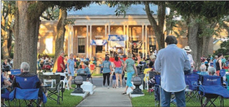
Our annual Blues Bash attracted more than 400 people in June.