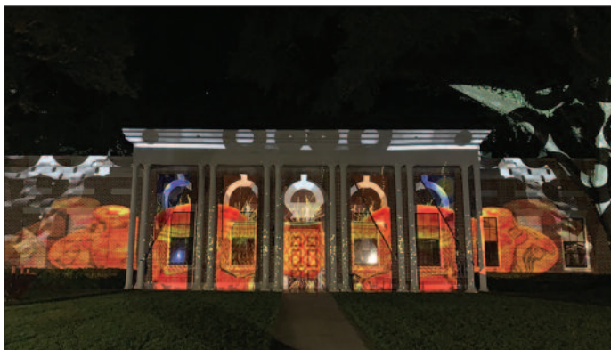
Music and light projection show will be October 19.

I hope you will make plans to join us for another memorable night of music and a light projection show on the Museum's front lawn on the evening of Saturday, October 19. In response to last