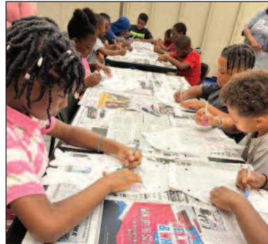
Weekly art classes were provided at the L. T. Ellis Center this summer.